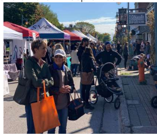
Fall Festival filled Portage Avenue with smiling faces for an activity filled day September 28th!

In October, Halloween SpookTacular brought thousands of costumed boys and girls (and pets) downtown to participate in business to business trick-or- treating. This thriving downtown event continues to bridge engagement from a great number of community partners who brought entertainment , in addition to trick-or-treating, increasing the evening's activities.