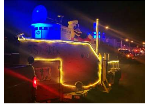
3rd Place Float Winner Lake Superior State University

Parker ACE Hardware Parade of Lights lit up the night November 29th!