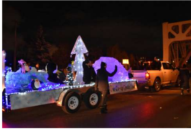
1st Place Float Winner Soo Co-Op Credit Union