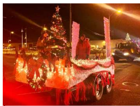
2nd Place Float Winner Sault Locks Childrens Museum