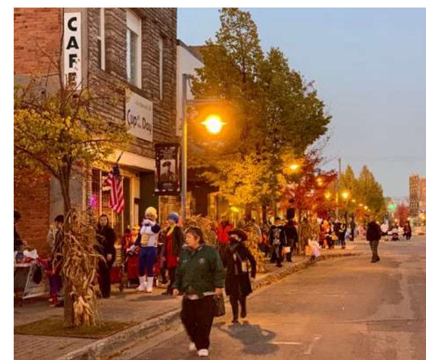
Downtown business owners "treated" hundreds of ghouls and goblins during Halloween Spooktacular October 25th

In October, Halloween SpookTacular brought thousands of costumed boys and girls (and pets) downtown to participate in business to business trick-or- treating. This thriving downtown event continues to bridge engagement from a great number of community partners who brought entertainment , in addition to trick-or-treating, increasing the evening's activities.